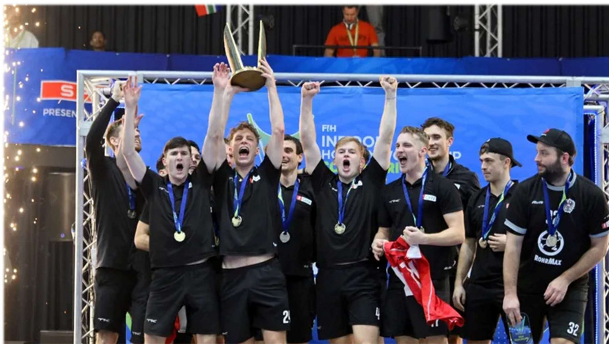
Having lifted the trophy in 2018 and 2023, Austria men are aiming for a third successive world title.

With full throttle hockey of the highest calibre, this is where you'll find non-stop action at every game. As a six-a-side indoor competition made up of 24 teams (12 men's and 12 women's), the FIH Indoor Hockey World Cup is an intense, action-packed and utterly thrilling spectacle for everyone lucky enough to witness it.